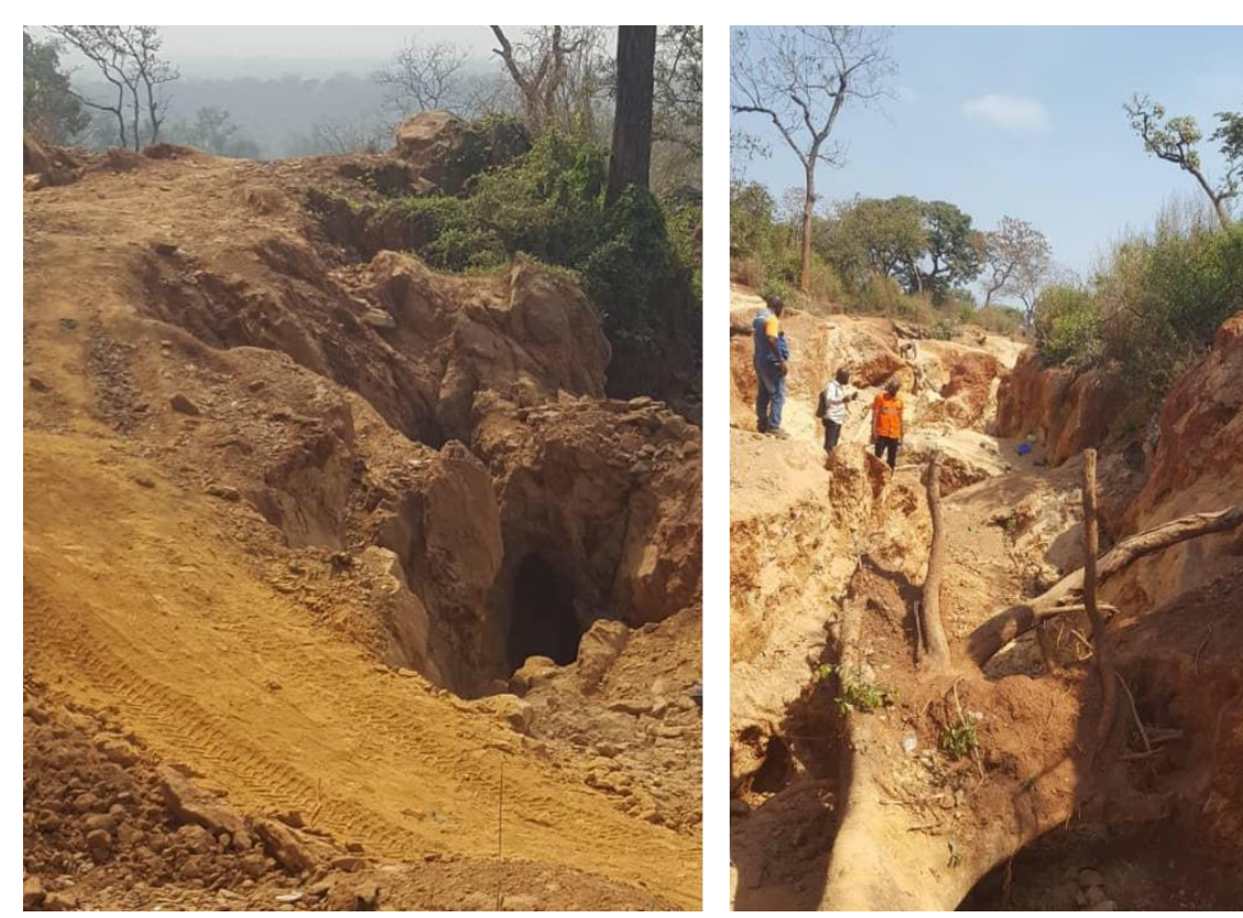
Figure 2: Artisanal activity recently identified on the Bobosso Exploration Permit

This information is being integrated into the drill and sampling database to define targets for follow up in Q1/2022. The aim at Bobosso is to prepare targets for an RC drill program during Q2.